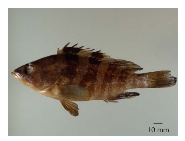
Fig. 1 Specimen of E. sexfasticatus caught in Penghu Archipelago, south-western Taiwan.

Two E. sexfasciatus specimens (FRIF0127D, FRIF0128D,) were caught by hook-and-line (roughly at a depth of 50 - 60m) in Siyupin islet (23°16, 515' N, 119°30, 168' E), a small island of Penghu Archipelago, south-western Taiwan on 28 June 2012 (Fig. 2b). The two specimens were immediately frozen and brought to Fisheries Research Institute (FRI), where the specimens were identified based on morphometric characters (as shown in Table 1) described by Heemstra and Randall (1993) and Craig et al. (2011). Measurement was taken to the nearest mm by using a digital caliper.